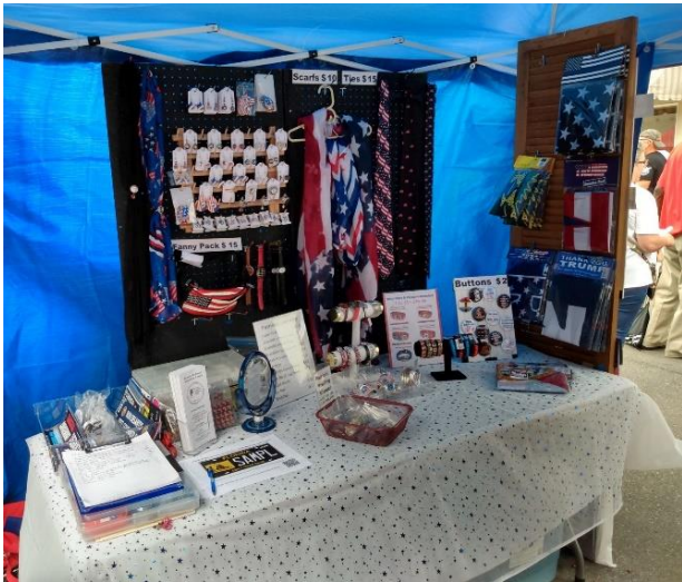
Inside Booth – Jewelry, Button & Flag Display