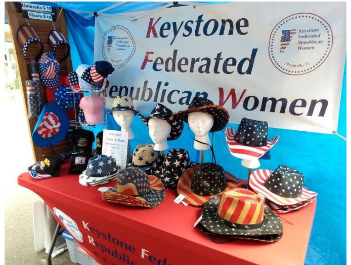
Inside Booth – Hat, Cap, Visor & Umbrella Display