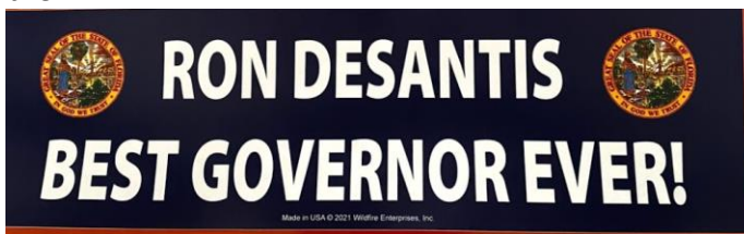
Bumper Sticker (shown above) & Magnets for Gov. DeSantis

Limited quantities of items. Pictures of all merchandise available to sell & purchase are on the KFRW Website by categories: Cowboy & fedora hats , bling & baseball caps , visors , reading glasses (1.0-3.5) , fanny packs , umbrellas , flags , magnets , bumper stickers , ties & tie bar , buttons , bracelets , brooches , earrings , lapel pins , scarf holders , watches , Trump shot glass , and tile & paracord bracelets . Contact Lynn if you have questions or to obtain items. ■