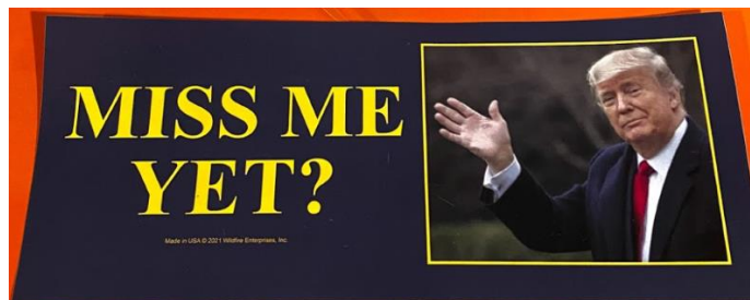
Bumper Sticker (shown above) & Magnets for Pres. Trump

Limited quantities of items. Pictures of all merchandise available to sell & purchase are on the KFRW Website by categories: Cowboy & fedora hats , bling & baseball caps , visors , reading glasses (1.0-3.5) , fanny packs , umbrellas , flags , magnets , bumper stickers , ties & tie bar , buttons , bracelets , brooches , earrings , lapel pins , scarf holders , watches , Trump shot glass , and tile & paracord bracelets . Contact Lynn if you have questions or to obtain items. ■