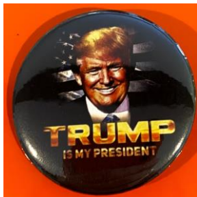
Button (shown above), Bumper Stickers & Magnets for Pres. Trump

Limited quantities of items. Pictures of all merchandise available to sell & purchase are on the KFRW Website by categories: Cowboy & fedora hats , bling & baseball caps , visors , reading glasses (1.0-3.5) , fanny packs , umbrellas , flags , magnets , bumper stickers , ties & tie bar , buttons , bracelets , brooches , earrings , lapel pins , scarf holders , watches , Trump shot glass , and tile & paracord bracelets . Contact Lynn if you have questions or to obtain items. ■