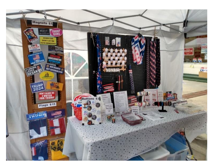
Inside KFRW Booth ~ Magnets, Flags, Jewelry, Etc.