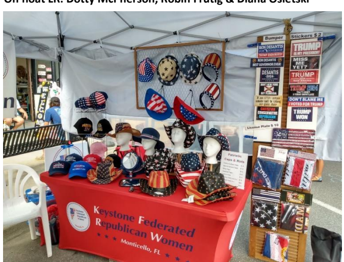
Inside KFRW Booth ~ Hats, Caps, Bumper Stickers, Flags