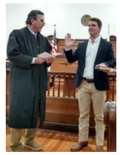
Commissioner Austin Hosford