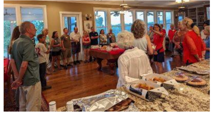
Above: Gathering for the Meal Blessing; Dig in; Watch the Movie