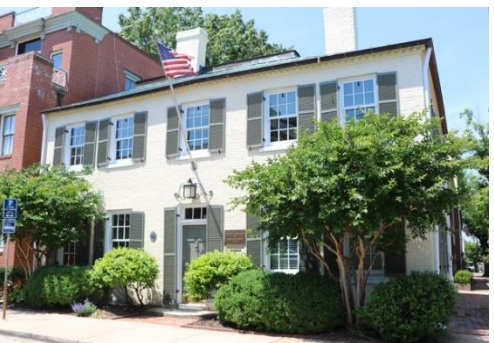
The Marion E. Martin Center

The building and its contents were purchased for $860,000 and another $40,000 for furnishing the property. In 1993, just 367 days after closing on the building, the NFRW paid the mortgage in