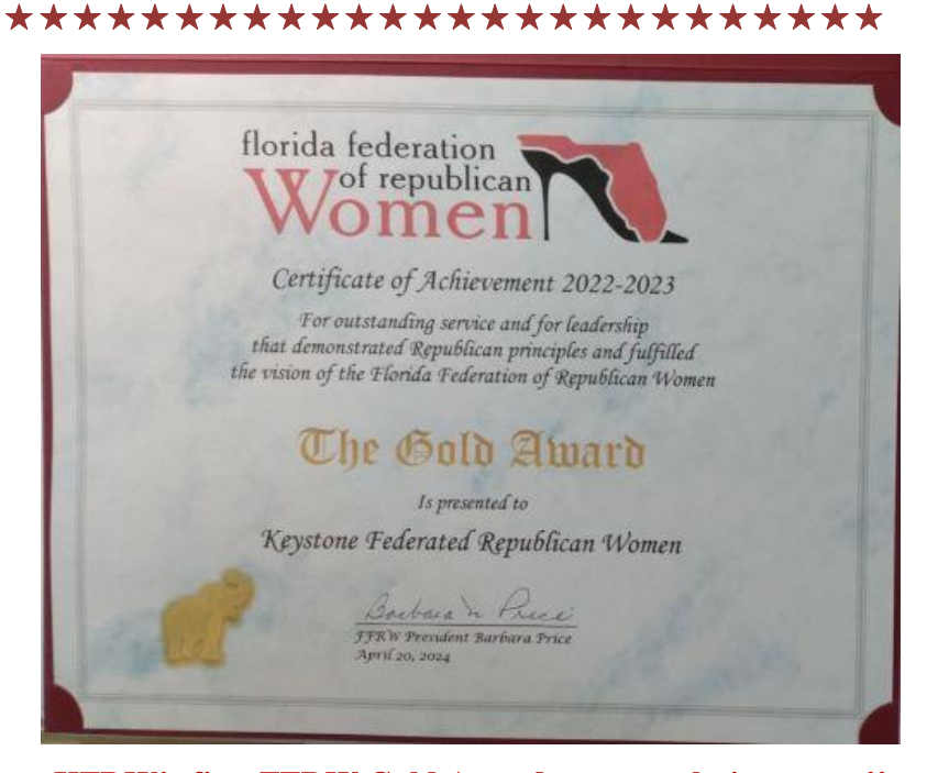
KFRW's first FFRW Gold Award, congratulations to us!!